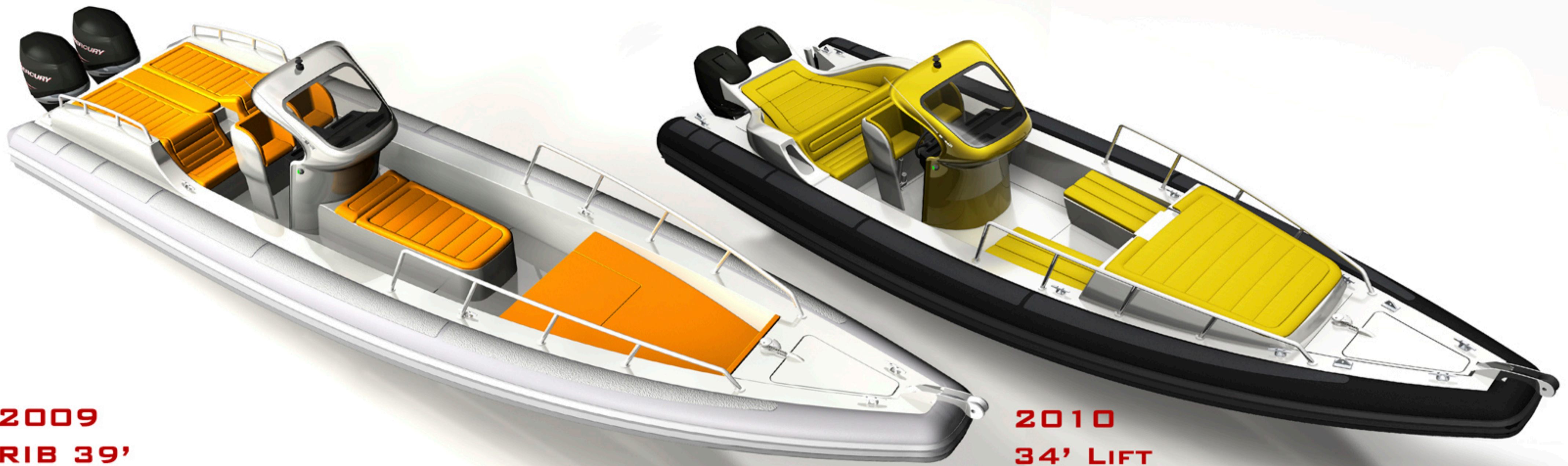
2009 RIB 39'