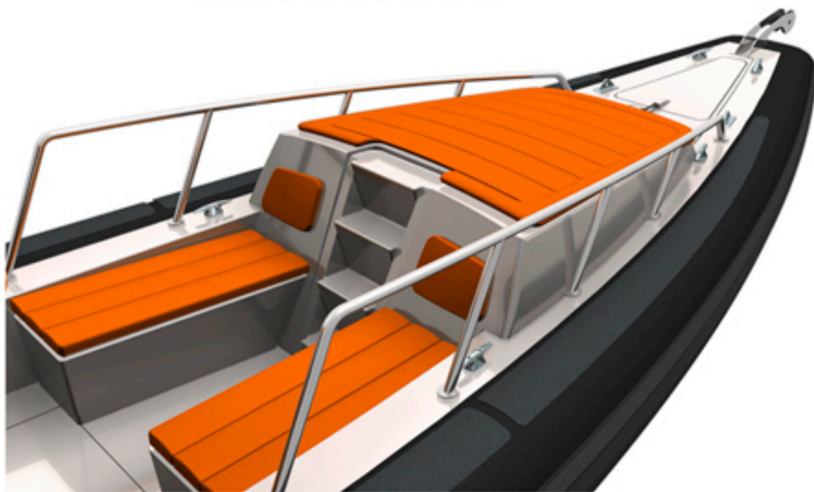
Front sunbed and table