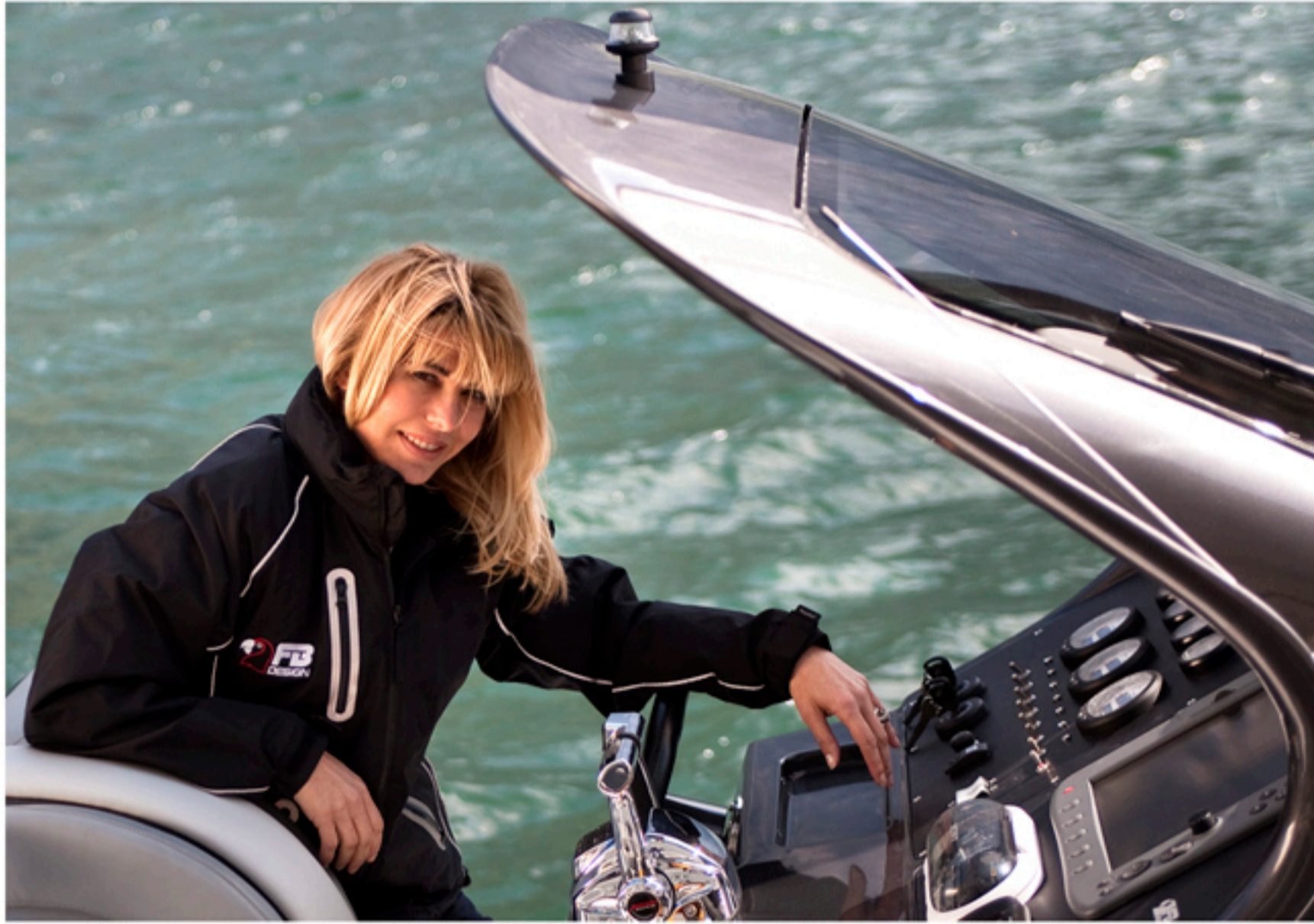
Driver and co-driver are located on a tecno-double seat