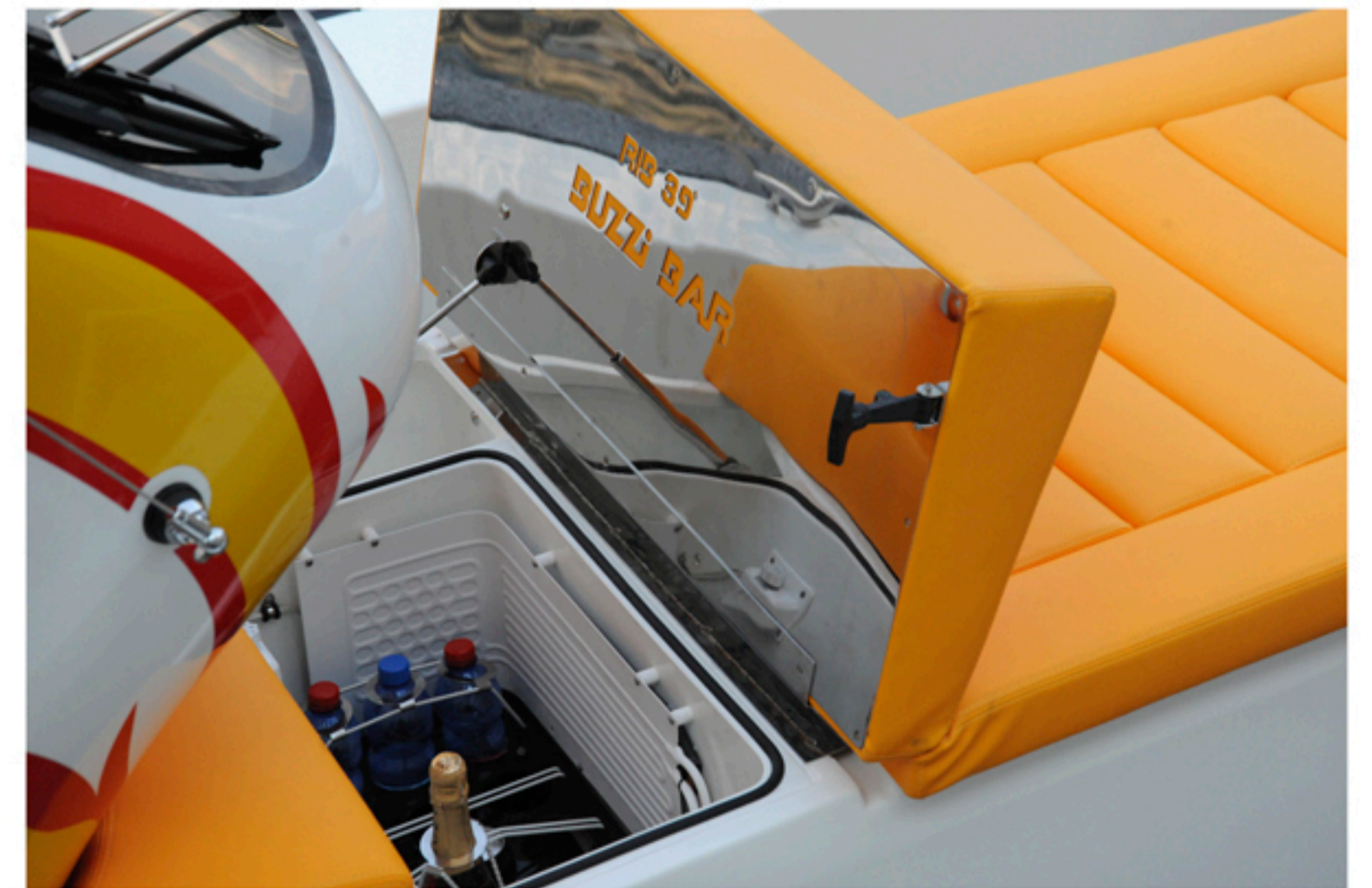
Central sunbed with enclosed bar