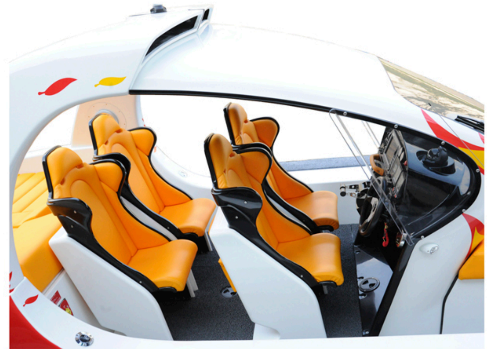
Console and G12 seats