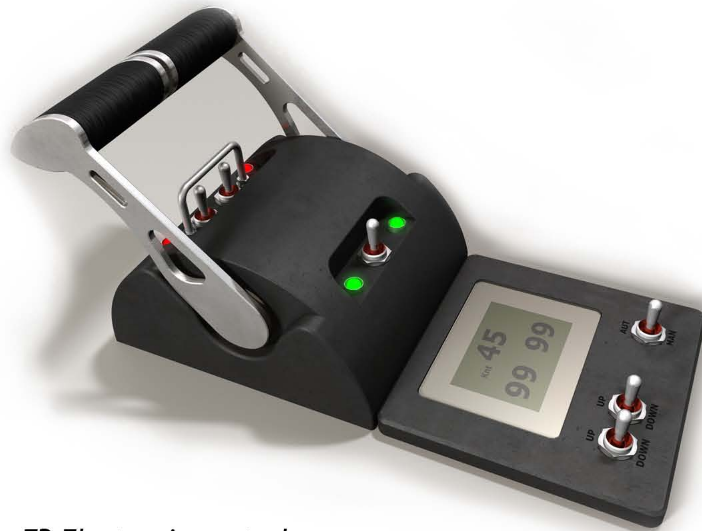
FB Electronic controls